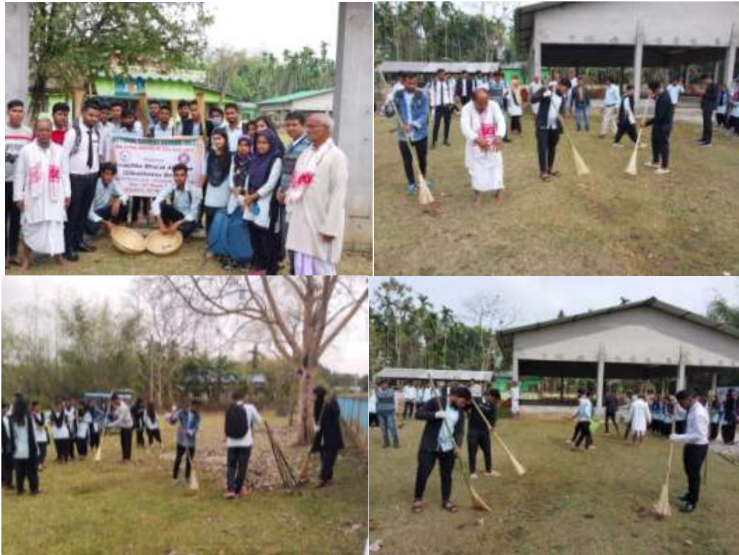
Plantation and Preservation Programme organized by Dept of History and Economics ay adopted village Gosaibori, Sri Sri Damodar Dev Satra Campus on 12/5/2022